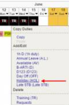
Accepting crew duty request