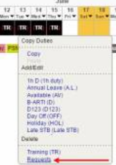
Rejecting crew duty request

Before this change, crew were able to make requests in the Duty Roster only for days without assigned duties.