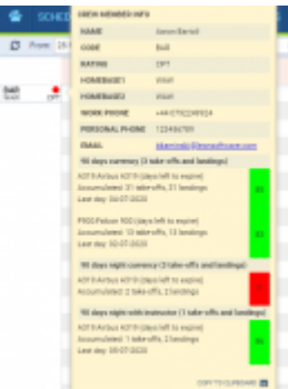
Crew currency status in Crew Panel

Functionality to show Crew currency has been added to Crew Panel.