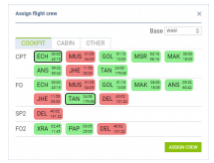
Assign crew window