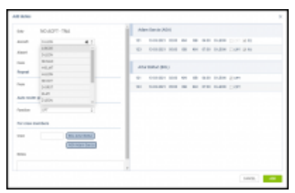
Aircraft duty page

This type of duty, works similar to those defined on a particular aircraft tail, however, it is especially useful for operators with bigger fleet as it saves creating many duties on each aircraft tail separately. For the crew to get assigned to the flight automatically Auto Roster needs to be selected when defining the duty.