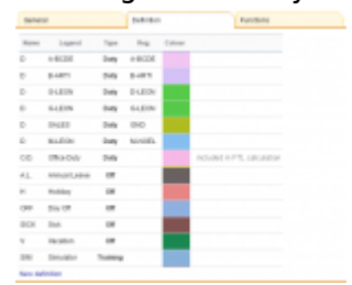
Duties - general view on defined duties

Defining a new duty in a section Duties Setup > Definition