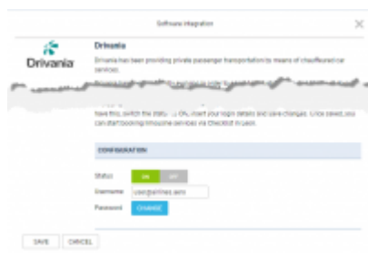
Drivania integration section

Drivania has been providing private passenger transportation by means of chauffeured car services.