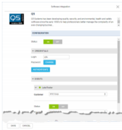
Q5 integration section

Q5 Systems has been developing quality, security, and environmental, health and safety software since the early 1990's to help professionals better manage the complexity of an ever-changing business environment and the inherent risks associated with every day operations.