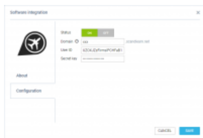
Scandlearn in the Integrations Panel

Scandlearn is the ultimate all-in-one crew training solution for companies, organisations and authorities, at any size, including the ones in the aviation industry.