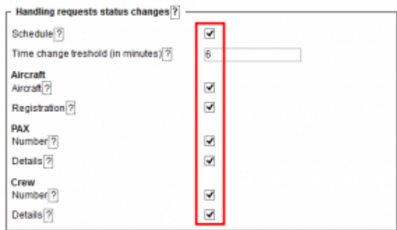
Handling Request status changes checklist

In order to do it you have to go to Admin > Operator settings > Handling Requests tab where you will find HR status changes checklist. The checklist consists of a list of items as shown in the screenshot, which when ticked will affect the status and change it to ? and vice-versa (unticked - changes made to a flight will not change the status). “Time change treshold” allows to set a time buffer. If the schedule is changed by fewer minutes than indicated in this option, the HR status will not change.