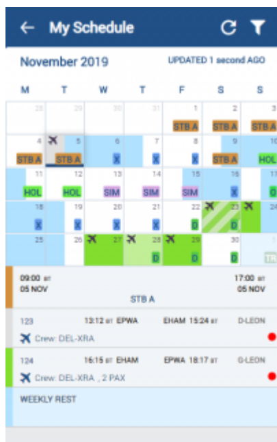
My Schedule view

'Weekly Rest' for this purpose is considered as 36h free of duties including two local nights in 168h period.