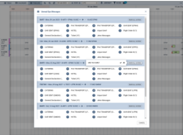
'Message Centre' view

Message Centre is available in all the OPS views - Table, Calendar, and Timeline.