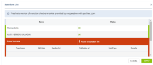
'Paxfiles' search results window

Currently, the functionality can only be used in the OPS Checklist.