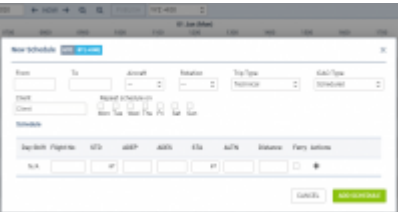
UTC/BT selection option when creating a new schedule

An option to select between UTC & chosen BT also appears when creating a NEW SCHEDULE