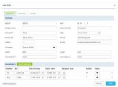
Adding new crew to Leon