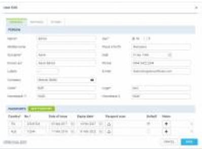
Adding new crew to Leon