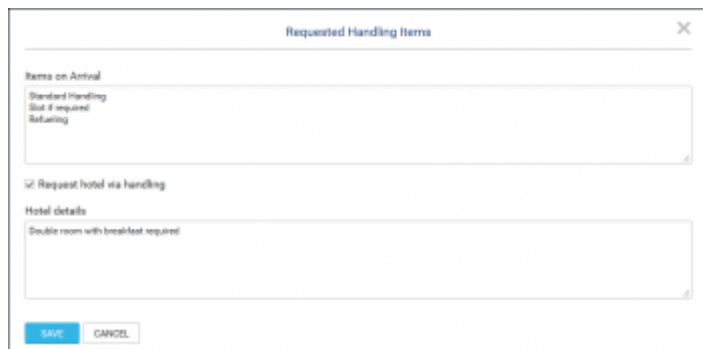
Requested items and Hotel window