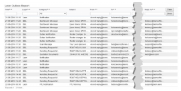
Leon Outbox report

Leon Outbox Report allows you to view details of any notifications that were sent from Leon. This is very helpful when a notification email did not arrive and you would like to check if it was actually sent.