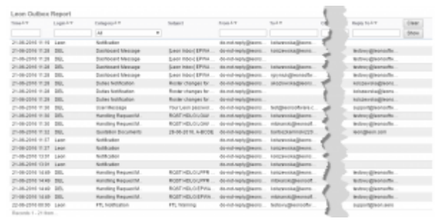
Leon Outbox report

Leon Outbox Report allows you to view details of any notifications that were sent from Leon. This is very helpful when a notification email did not arrive and you would like to check if it was actually sent.