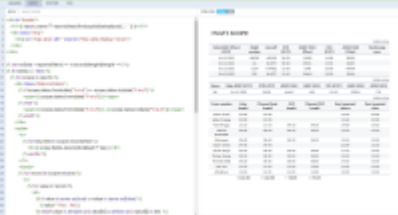
Editing the report in HTML

On the main page Leon shows scopes on the menu bar , available to be selected & configured separately.